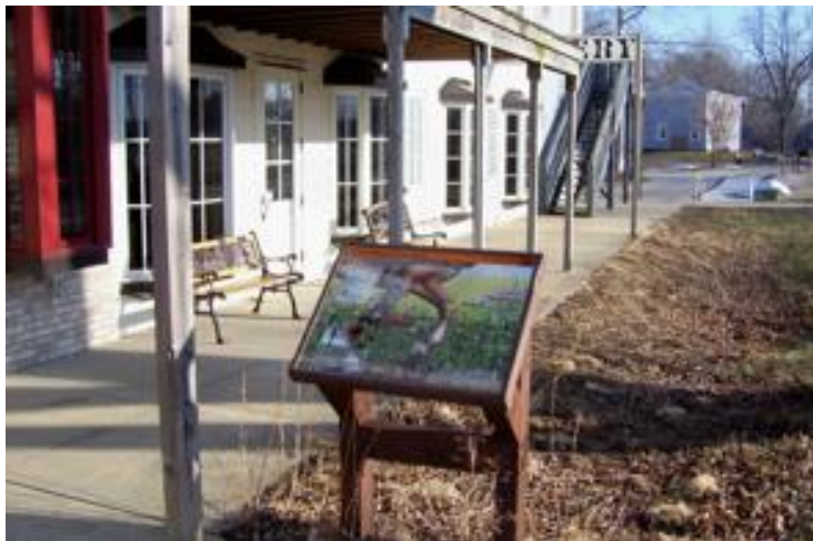
Yet another panel explains the "horse power" that pulled canal boats along from the adjacent towpath. It stands in a small prairie plot (which seasonally grows tall) just outside the Canal Center.