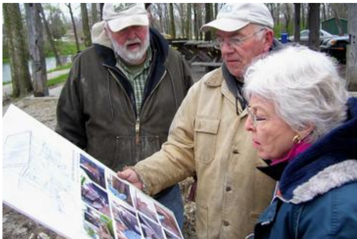
Former Indiana First Lady, Judy O'Bannon recently visited the

Beneath the scale shed is a pit that contains the metal beams that will "float" or balance the 8 by 14 foot ground level platform. Farmers could easily pull their wagons over the scale to be weighed. The oak beams shown form the parameter of the pit and the weighing platform itself will be suspended over this opening.