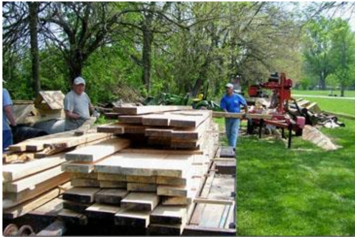
Next, they cut the rafters from more logs donated for this project. The M-W-F crew stacked fresh cut 2x10s from Rollin Graybill's portable sawmill (seen in the background.)