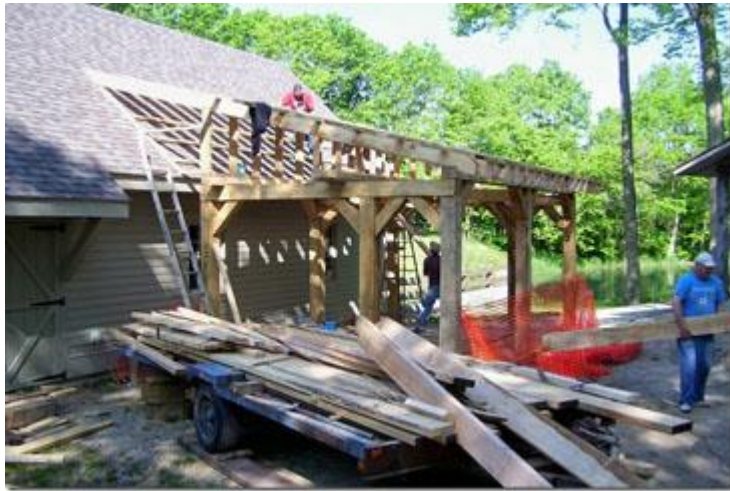
Rafters are placed to make the Scale House a "shed" attachment to the Canal Boat's home along the canal.