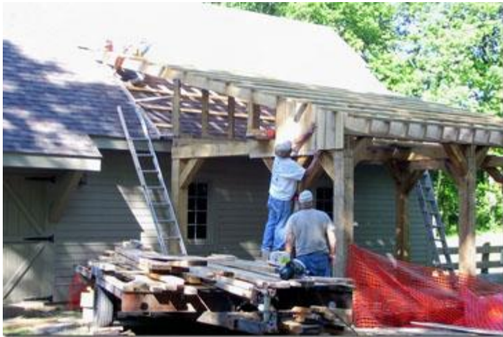
Board and batten siding was also cut from white oak to fill in the sides. Later, a picket-style lower side railing with gates will allow entry of cargo to be weighed.