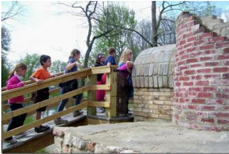
Students eagerly wait to inspect the firebox that provided heat to make the limestone become powder. The final products of the process were plaster, mortar and whitewash.